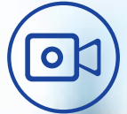
Integrated 4K Camera