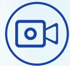
Integrated 4K Camera