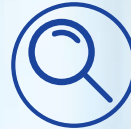
Continuous Zoom System