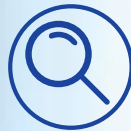
Motorized Continuous Zoom System