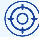
VarioScope Fine Focus