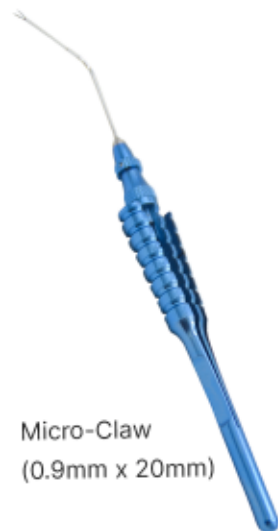
Micro-Claw (0.9mm x 20mm)

Each package includes 1 tweezer head, 1 handle, and 1 cleaning adapter. Specifications: 0.9mm x 20mm